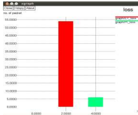
Fig 2. Packet loss vs number of packet