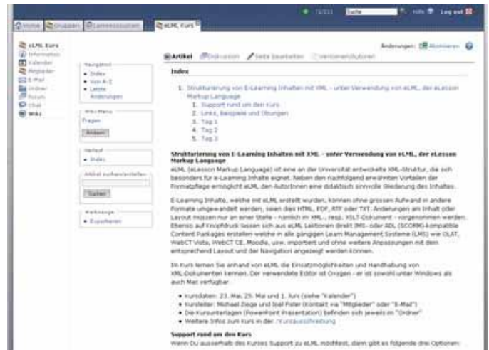
Fig1. Wikis were one of the new features in OLAT 5