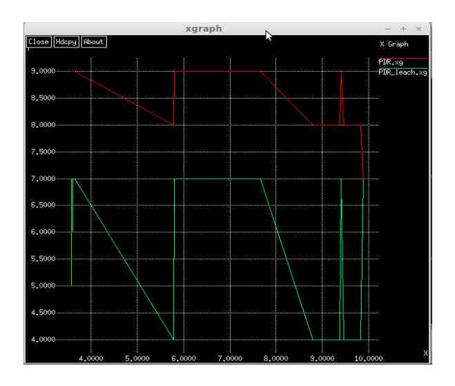
Figure 1: Packet Delivery Ratio

Packet delivery ratio is defined as a percentage of nodes that successfully receive a packet from the tagged node among the receivers that are within transmission range of the figure 1 shows the packet delivery ratio between Leach-m and proposed system is shown.Y-axis represents values of packet delivery ratio,x-axis represents time. PDR of proposed system is high compared to LEACH-M.