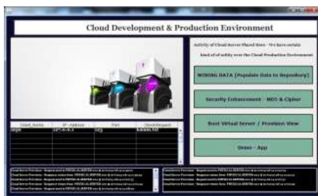
Figure 5.1: Result

In data center having mining setup for retrieve the data from the data storage. In data storage wants to store the number of files with the help of query processing from server. In this method using SVM for classify the data for the user query searched from the server.