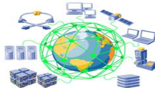
Figure 1: Heterogeneous Resources of Grid Computing

Grid computing can be viewed a process of distributed computing that shares data, application, computing and networking resources and storage [3]. Grid computing promises to deal complex computational issues, storage capacity and network information measure by granting users a wider IT capability. Grid application starts by meeting out the collection of customer needs followed by selecting the appropriate grid computing resources catering to the needs.