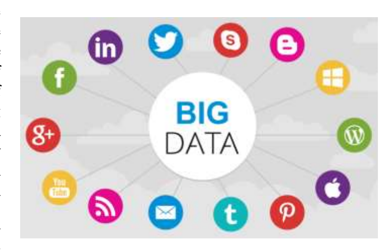
Figure 1: Sources of Big Data

system. Figure 1 show basic component big data. This figures sources of the big data from these are common sources of the big data. Now a days social media and online shopping website generate huge of data per day which require very good tools for the handling this huge amount of data for various purpose such as predictive analysis and decision support system.