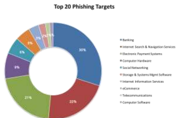
Fig. 2: Lookingglasscyber Weekly Phishing Report – July 2017

This report is generated by Lookingglasscyber by pulling information from major ISPs, partners, clients, feeds, and their own proprietary honeypots and web crawlers [8].