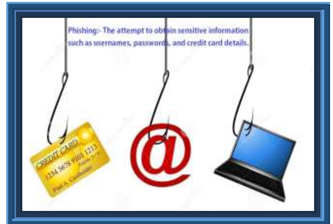
Fig. 1: Phishing Attack

Commonly spoofed website include eBay, PayPal, Various banking and escrow service providers and e-tailers [7]. Phishers might have a lot of approaches and tactics to conduct a well-designed phishing attack. The on-line banking consumers and payment service providers, those are the main targets of the phishing attacks, are facing substantial financial loss and lack of trust in Internet-based services. In order to overcome these, there is an urgent need to find solutions to combat phishing attacks. Detecting the phishing website is a complex task which requires significant expert knowledge and experience [1].