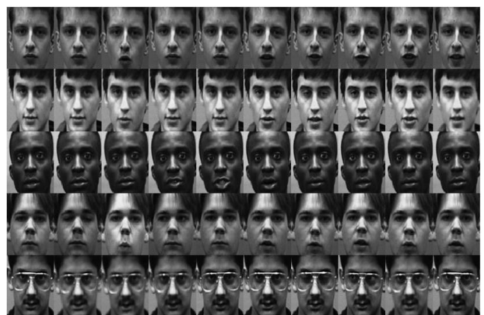
Fig 8.1 ORL Database

The Similarity matching is achieved by using Euclidian distance method. Fig.8.a, b shows the Query face image and the retrieved face images of 5 most similar images illustrated respectively. The Average Retrieval accuracy and Average Standard deviations class wise retrieval accuracy and standard deviation using LWT-PCA for both level1 and level2 decomposition Table is shown in Table 1.