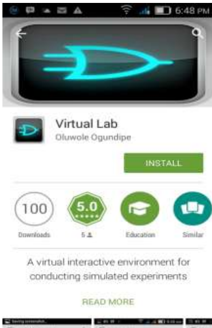
Figure 2. Virtual Lab in the Google app store

Figure 2 is a screenshot of the virtual laboratory app in the Google play Android app store for download. It is the screenshot of the installation interface indicating the number of downloads, the rating of the app and the category the app belongs to for the user to take an informed decision before downloading.