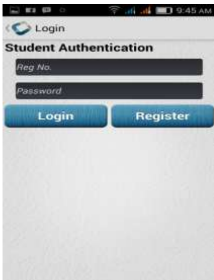
Figure 3 is a screenshot of the students authentication interface that receives the unique identifier (Reg. No.) and the password for login.

Figure 2 is a screenshot of the virtual laboratory app in the Google play Android app store for download. It is the screenshot of the installation interface indicating the number of downloads, the rating of the app and the category the app belongs to for the user to take an informed decision before downloading.