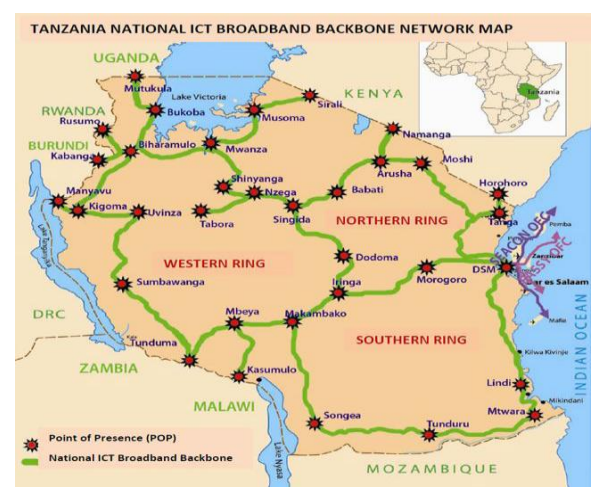
Figure 2: Tanzania National ICT Backbone Map

application for vehicle speed limit monitoring and accident reporting in Tanzania.