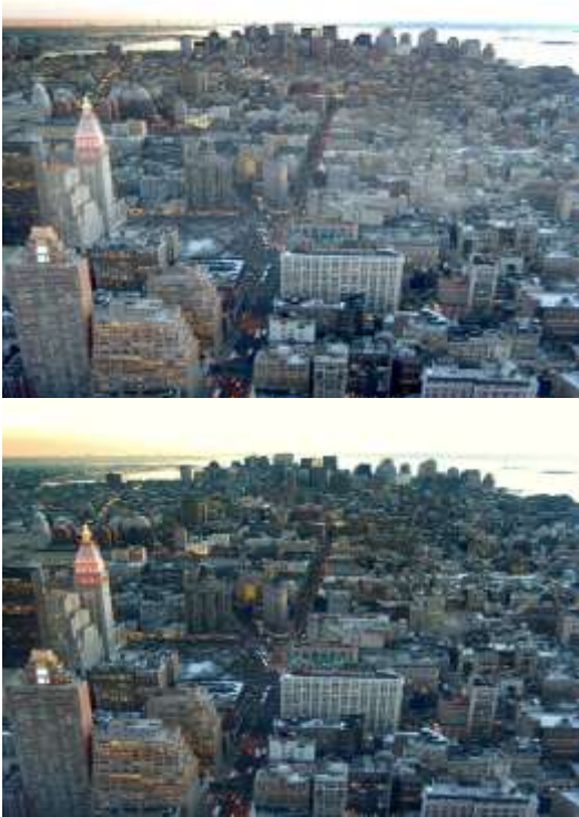
Figure 1.3: Comparison with the 3D-geometry-based method. Left: input. Middle: the result of . Right: our result

our dark channel prior provides reliable estimation in much more regions than Fattal's method.