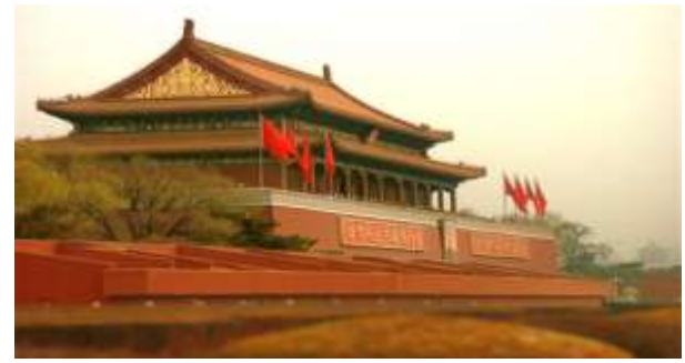
Figure 1.2: Defocusing on three different positions. The input image and depth map