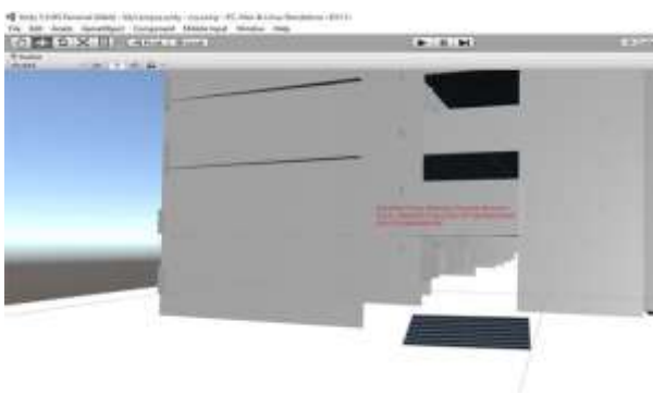
Fig: Building Department Front View

In above figure you see the front view of the building, in the front view you see the only stair part of building.