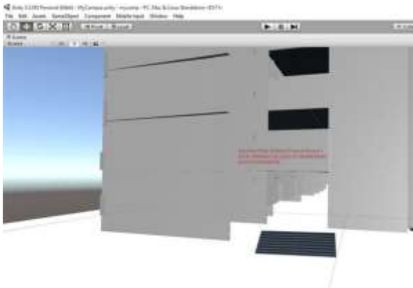
Fig: Main Department

Main building consists of four floors one is main office, first year floor, Electronic Telecommunication floor and last is Computer Science.