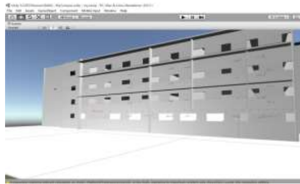
Fig: Building Department Side View

In above figure you see the front view of the building, in the front view you see the only stair part of building.