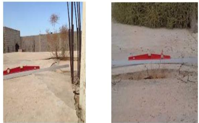
Fig 5. Differential heaving of slab S1