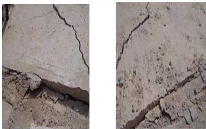
Fig 4. Cracks at the corners of slab S1 due to warping