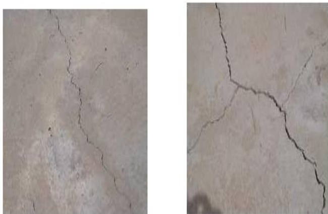
Fig 3. Typical crack pattern of one- and two-way slabs