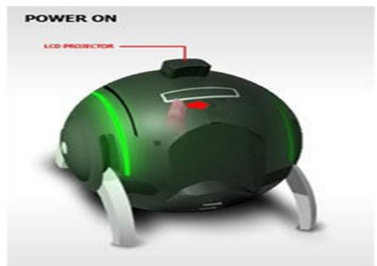
Figure 2. Elements of E-BALL:

After this the on/off button shown in figure 2 on the top of the E-ball must be pressed to turn on the PC and then the Projector pops up. After this the focus, direction etc can be adjusted using the navigation buttons.