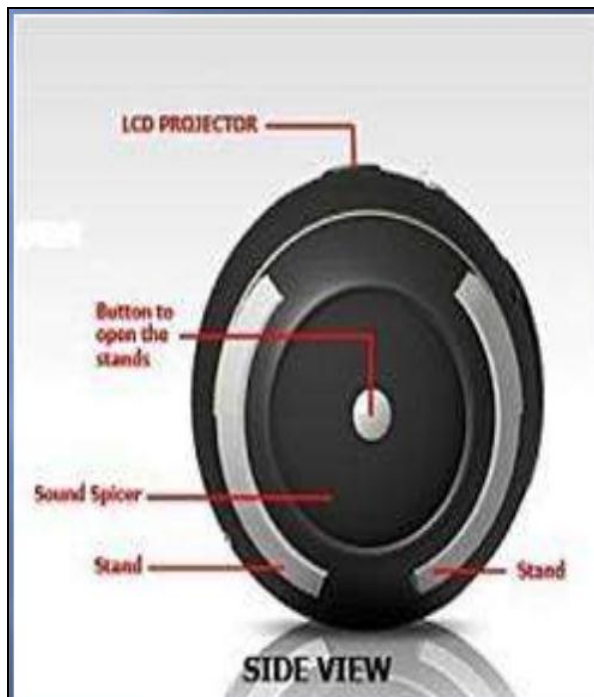
Figure 4. SIDE VIEW OF E-BALL