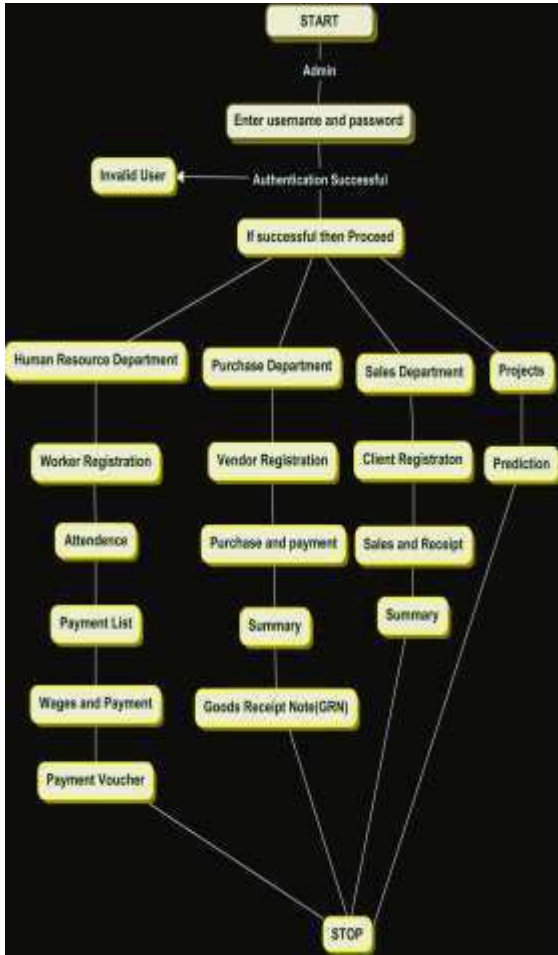
Fig 2. Flow chart