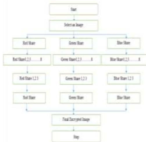
Fig4.2:Proposed Image Encryption Method