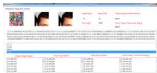
Fig 4.3: Data Hiding process