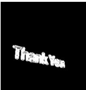
Figure 4: Added noise