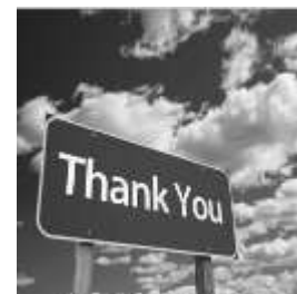
(b) Grey image