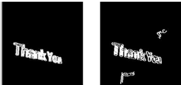
(a) Sobel noise removal (b) Canny noise removal