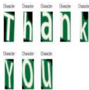
Figure 7: Extracted characters