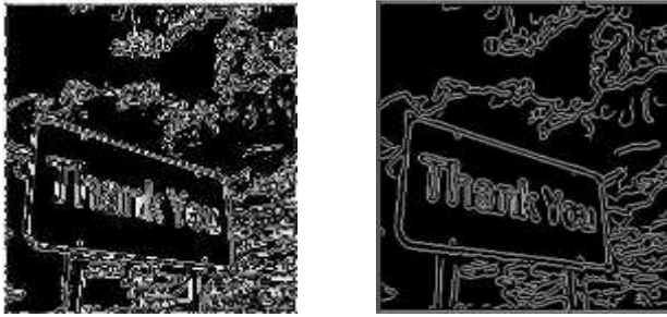
(a) Sobel edge detection (b) Canny edge detection