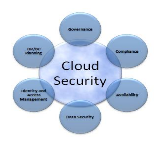
FIGURE 1: CLOUD SECURITY

All the above three states of cloud computing are vulnerable to security breach that makes the research and investigation within the security aspects of cloud computing practice an imperative one. Cloud computing comes with various possibilities and challenges simultaneously. Of the challenges, security is considered to be essential barrier for cloud computing in its path to success[5]