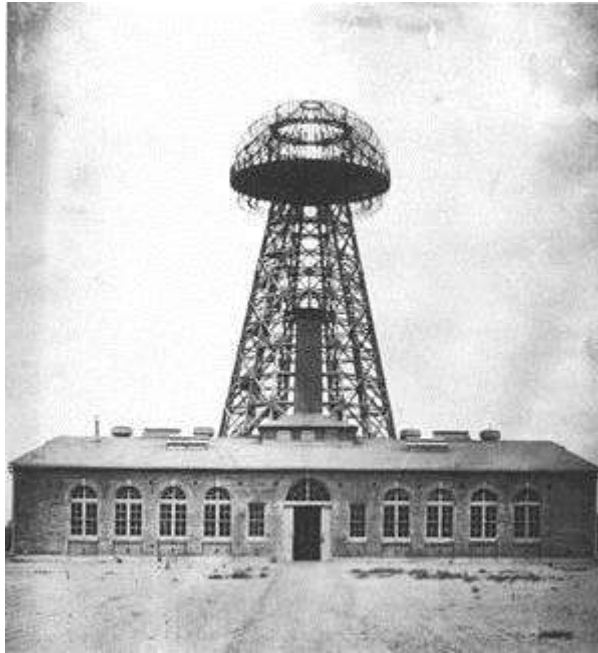
Figure 2: 1904 image of Wardencliff Tower located in Shoreham, Long Island, New York.

The basic working of wireless power involves transmission of energy from a transmitter to a receiver via an oscillating magnetic field. To achieve this, Direct Current (DC) supplied by a power source is converted into high frequency Alternating Current (AC). The AC energises a copper wire coil in transmitter that generates a magnetic field. Once a second receiver coil is placed within range of the magnetic field, it can induce an AC in the receiving coil. To summarise: