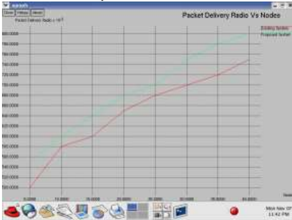
FIG 1:Packet Delivery Ratio Vs Nodes

Fig. 1 presents the throughput performance in the three scenarios described above for various values of PER_{RID} . First, we can see that the theoretical and the simulation results are almost perfectly matched, thus verifying our analysis. Comparing with simple compressive sensing schemes which have only the advantage of spatial diversity without any network coding capabilities, we can achieve a throughput enhancement up to 80%.