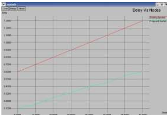
FIG 2:Delay Vs Nodes

Fig. 2 presents the packet delay in both network coding-based and simple EOEERP protocols. In this point, we must recall that two packets are delivered to their respective destinations in each retransmission cycle .