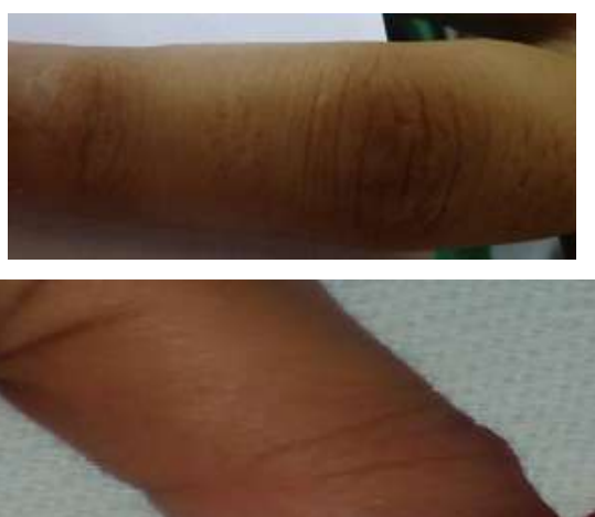
Fig. 1.2:Finger-knuckle print images used for analysis a) Front Side, b)Left Side

Firstly we load the original and distorted Finger-knuckle print images to analyse the quality of distorted images by taking original images as reference. This method is known as full reference modals. The Finger-knuckle print images used are as follows:[3]