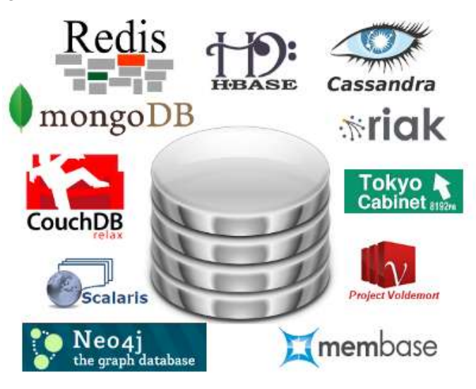
Figure 1: Popular NoSQL Databases

This technology provides the scalability and availability. NoSQL does not have any type of deterministic architecture and permits schema migration without downtime. It solves the problem of Rdbms.