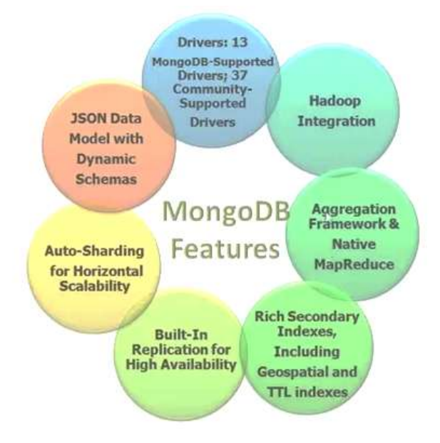
Figure 2: MongoDB Features

combine and transform documents. CouchDB works well with modern web platform. CouchDB can be used to distribute data, efficiently using CouchDB's incremental replication. It supports master-master setups with conflict detection automatically [4].