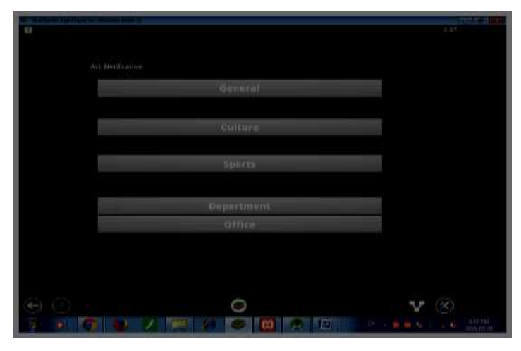
Fig. 5: NoticeApp main display on BlueStack

After student login, he can access the NoticeApp. The Screen shown in Fig.5 describes the general, cultural, sports, department and office sections in which the different notices are organized.