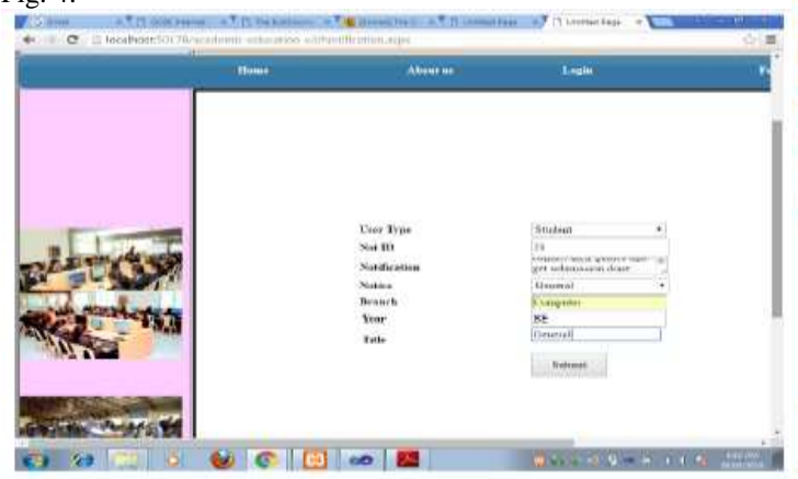
Fig. 4: Notice generation

Admin can generate the notice by selecting the user type, notice id, detail notification, branch, year and title shown in Fig. 4.