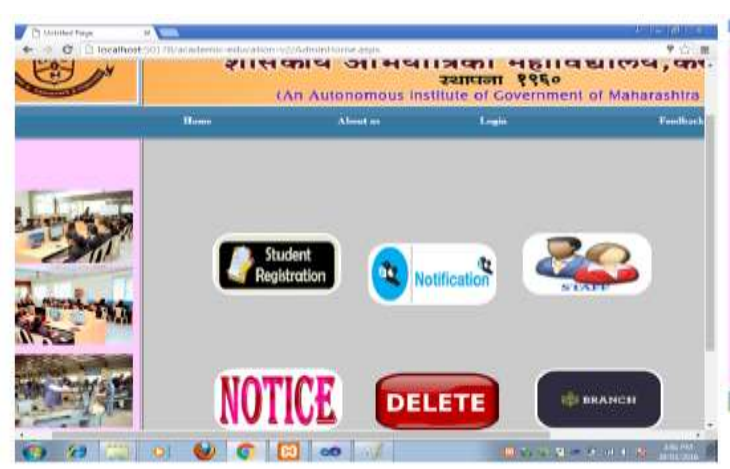
Fig. 3: Admin Homepage

Admin can generate the notice by selecting the user type, notice id, detail notification, branch, year and title shown in Fig. 4.