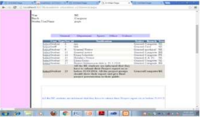
Fig. 6: Notice display

Student select the particular section, notices were displayed as shown in Fig. 6.