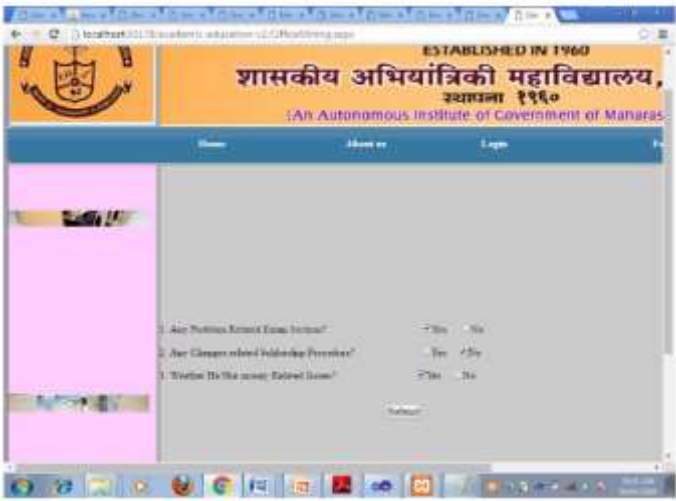
Fig. 7: Sample specific feedback

A sample questionnaire shown in Fig. 7 was generated and displayed to the particular student by the system when the frequently visited notice count reaches up to the threshold value.