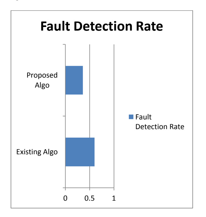
Fig 3: Fault Detection rate comparison

As shown in figure 2, the comparison is made between proposed and existing algorithms in terms of accuracy and it is been analyzed that accuracy of proposed algorithm is 87.26 percent and 80.67 percent accuracy is of existing algorithm.