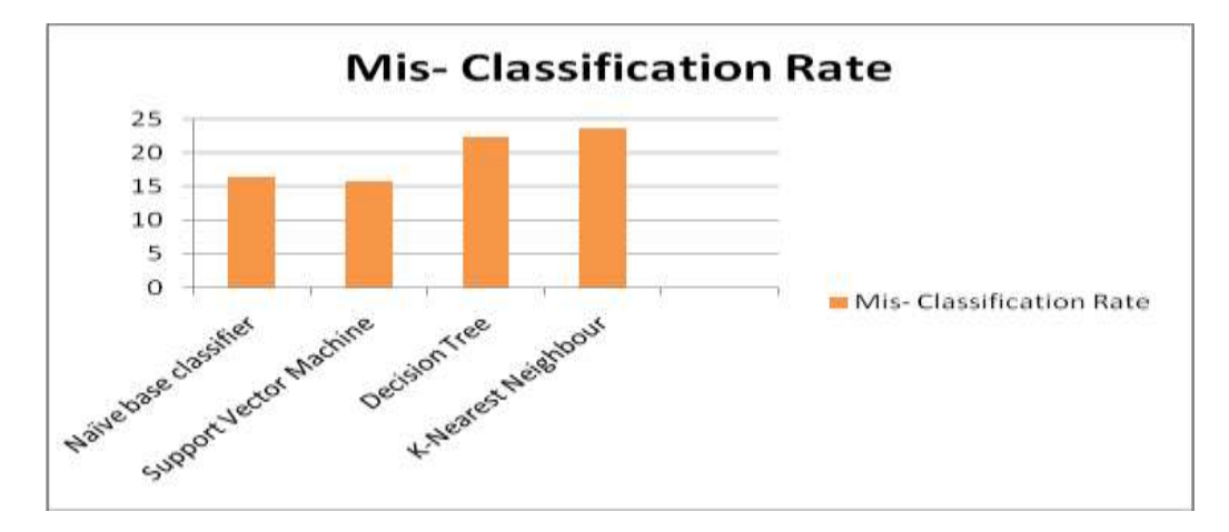
Graph for Correct Classification VS. Misclassification rate