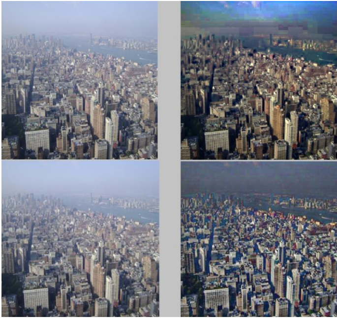
Figure 2 shows the results for Proposed approach

Table 1 shows the results for Base and Proposed fusion approach based on TIME, AVERAGE EDGE, GRADIENT and VISIBILITY.