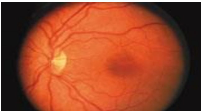
Fig.2.1: A normal retina

Diabetic retinopathy, the most common diabetic eye disease, occurs when blood vessels in the retina change. Sometimes these vessels swell and leak fluid or even close off completely. In other cases, abnormal new blood vessels grow on the surface of the retina. The retina is a thin layer of light-sensitive tissue that lines the back of the eye. Light rays are focused onto the retina, where they are transmitted to the brain and interpreted as the images you see. The macula is a very small area at the center of the retina. It is the macula that is responsible for your pinpoint vision, allowing you to read, sew or recognize a face. The surrounding part of the retina, called the peripheral retina, is responsible for your side — or peripheral — vision.