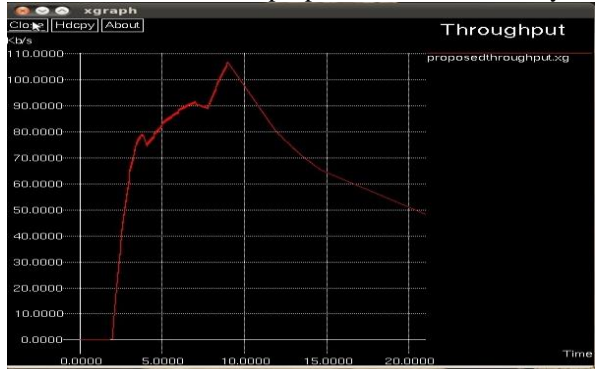
FIGURE 2: THROUGHPUT

Following performance parameters are to be considered to evaluate the effectiveness of proposed mechanism. They are;