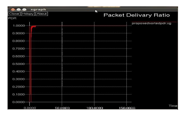
FIGURE 4: PACKET DELIVERY RATIO

In digital transmission, the number of bit errors is the number of received bits of a data stream over a communication channel that has been altered due to noise, inference, distortion or bit synchronization error. Figure 3 shows the bit-error rate that is number of packets transmitted is plotted in Y-axis. Time taken for transmission of packets is plotted in X-axis. Initially when data packets are transmitting there exist some number of bit-error rate in the system. This thereafter attains a state which is almost stable in condition. And this increases gradually, because of increase in bit-error in the system over that time.