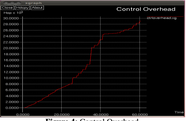
Figure 4: Control Overhead

Control overhead is sending payload data beyond communication network, it requires to sending the strong payload data. I can be achieve trusted communication of the data, when it sending the control or outstanding data.