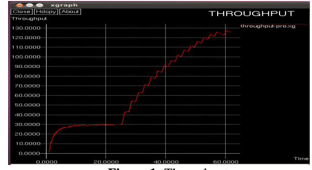
Figure 1: Throughput

Throughput means average rate of accomplished message convey over a correspondence channel. This information might be conveyed over a wired or remote connection, or may go through a specific system customer. The throughput is for the most part measured in bits consistently (bit/s or bps). Throughput is measure of information got by the collector.