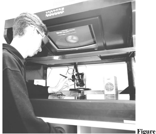
1: The Haptic Workbench, showing PHANToM haptic device.

We are using an immersive virtual environment that we have named a Haptic Workbench and described by Stevenson .It is an extension of a Virtual Workbench developed by the institute of Systems Science at the National University of Singapore,