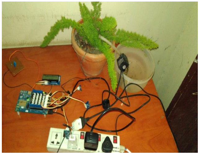
Figure2: Connections establishment

Figure below shows the connection establishment for the different sensors, relay and for the power supply, it is the first and foremost setup user needs to do to gain the complete usage by the System. And here Wi-Fi connection is mandatory for the transformation of the real time environmental conditions from the sensors to automate the watering service for the crops so that the productivity will get increased.