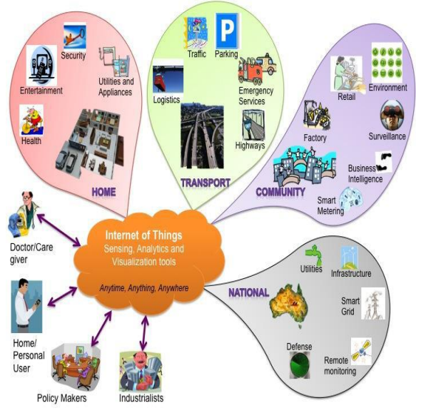
Figure 1: Schematic representation of IoT with end users and application areas

Below figure shows the schematic representation of the IoT with all the possible end users and application areas.