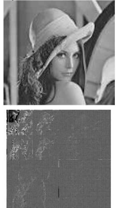
Fig 6.1.1: Lena image decomposed using DWT

Wavelets are functions defined over a finite interval and having an average value of zero. The basic idea of the wavelet transform is to represent any arbitrary function (t) as a superposition of a set of such wavelets or basis functions. These basis functions or baby wavelets are obtained from a single prototype wavelet called the mother wavelet, by dilations or contractions (scaling) and translations (shifts). The Discrete Wavelet transform of a finite length signal x (n) having N components, for example, is expressed by an NxN matrix.