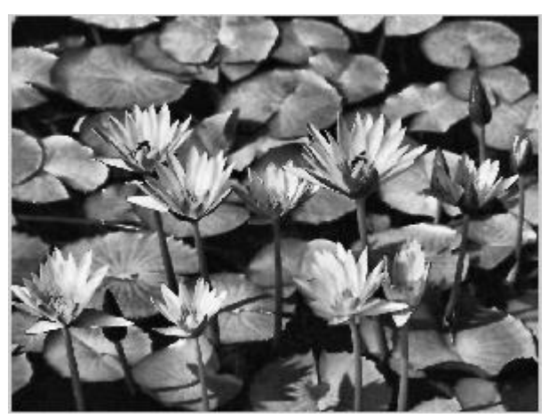
Figure 2. Enhanced image

equalization (CLAHE) method and wiener filter. In this concept we demonstrate the idea of de-noising of image using wiener filter and using this concept we take the histogram. In contrast limited adaptive histogram equalization we limit the contrast and take the histogram.