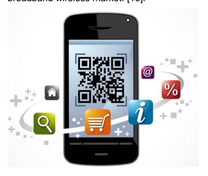
Fig:-1 Smartphone with full of Apps

Smartphones and netbooks are driving demand for mobile broadband and Wi-Fi networks, as these devices become the primary means for people to get online. Consumers are using wireless broadband to connect to the Internet. This trend holds promise for developing countries, where many consumers cannot afford a laptop or personal computer, or have no access fixed-line broadband to Smartphones operating on a mobile broadband network can provide access to the Internet at a low cost. particularly if operators provide handset subsidies to "seed" the growing broadband wireless market. [16].