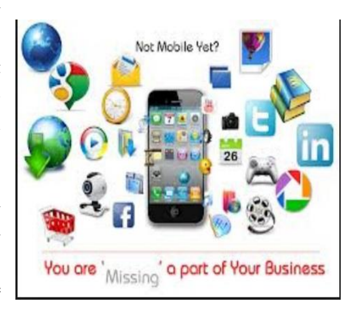
Fig:4 Smartphone with so many enterprise apps

The prediction is based on a survey of 1740 organizations in seven countries conducted last year. The market for business-focused mobile applications wills more than double in the next five years, according to market research Strategy Analytics.