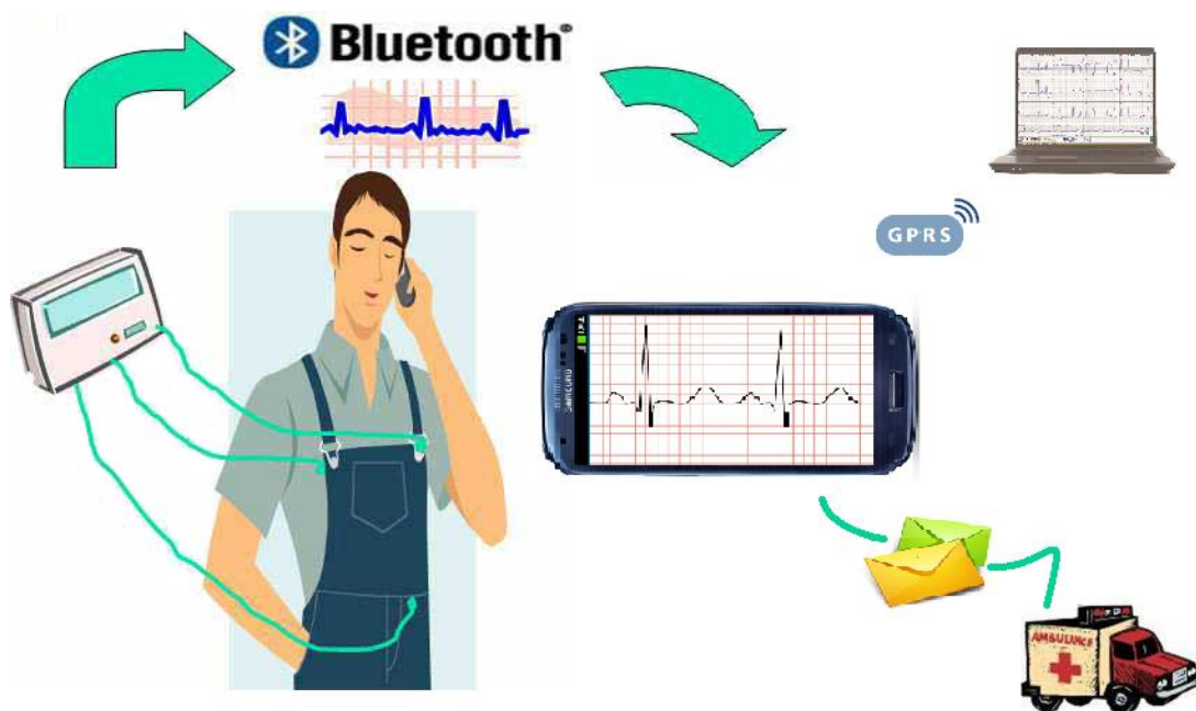
Fig. 4 Sender (ECG monitor) Architecture