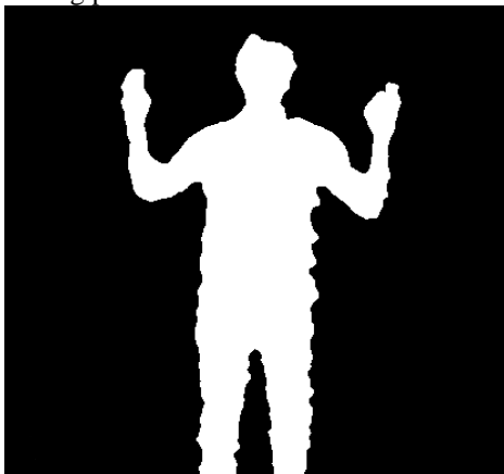
Figure 2: Region of interest (Human).

In [9], for preprocessing stage, they have used Z-score normalization on body joint positions and input vectors of twenty body joints positions for motion tracking. They have used back propagation neural network, support vector machine, decision tree, naïve bays for gesture recognition. This system takes input as depth frames captured from Kinect camera. The depth information contains information of distance between camera and objects. This depth data has some noisy pixels and if we use this depth data for further processes, then we will not get correct features. The system performs preprocessing by setting noisy pixels value as per the neighboring pixels.